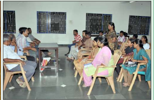
CA Students Orientation Programme